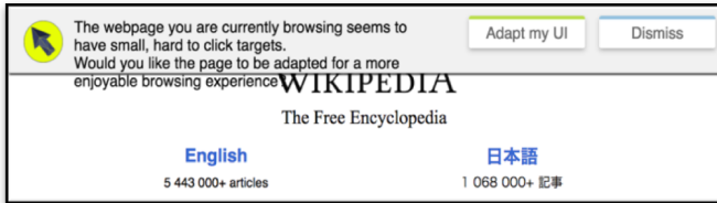
Figure II: The user triggers a notification when a specified number of slips is detected. The user can then select to activate the adaptation or dismiss the notification.

over a new element. If the adaptation is active, the JavaScript event called onkeypress will take the user to the stored link if the hotkey on the keyboard is pressed. This sequence of events is demonstrated in Figures II and III below.