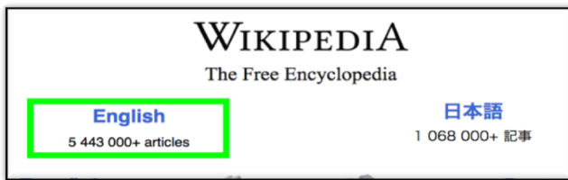
Figure III: After pressing the “Adapt my UI” button, the web page adds a green border over any element with a hyperlink. This indicates that the user may press the forward-slash (hotkey) on the keyboard to proceed to the link.